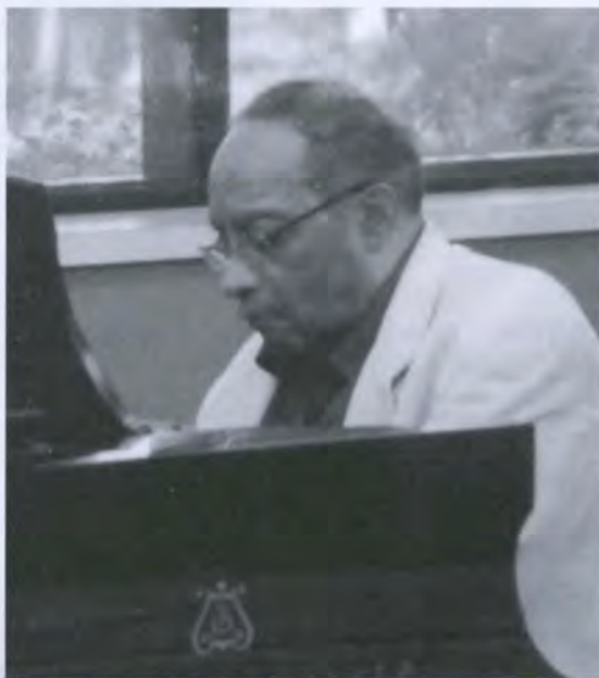
Charles Bowles George Benson Quartet • Salden Stage 1:45-2:45 pm and Steinway Solo Piano Room • 12:15-1:15