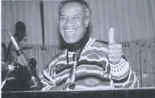
George Benson plays at 7:45 in Lower Waterman

The Woodbridge Group is a global leader in the production of automotive polyurethane foam components for seating, interior safety, headliners and acoustical applications. Also providing slab and roll goods foam products, contract assembly and sequencing services, engineering, prototyping, development and testing capabilities.